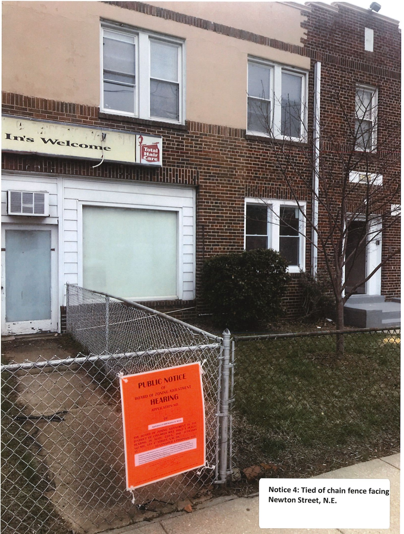
Notice 4: Tied of chain fence facing Newton Street, N.E.