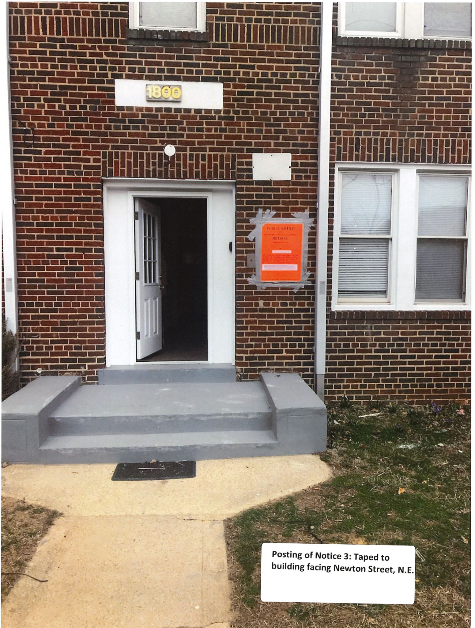
Posting of Notice 3: Taped to building facing Newton Street, N.E.